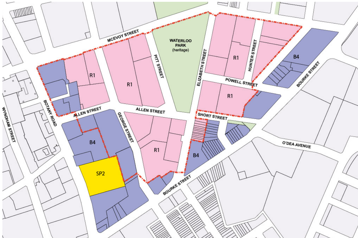
Figure 1 - Waterloo Park Precinct, edged in red

N.B. R1 General Residential Zoning currently applies to sites coloured pink, B4 Mixed Uses Zoning currently applies to sites coloured purple, as shown. Extent of coloured sites reflects boundaries of Waterloo Park neighbourhood defined in Sydney Development Control Plan 2012 .